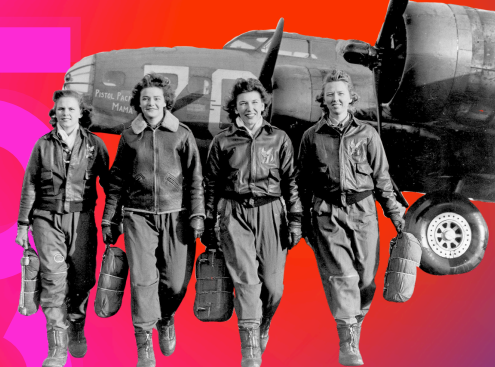
WOMEN AIRFORCE SERVICE PILOTS